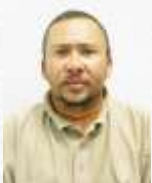
Earl Cloete General