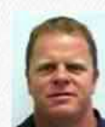
Allan Black Plumbing & Electrical